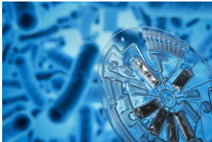
Centrifugal microfluidic LabDisk platform where the MagSi-DNA mf beads were first used [1]